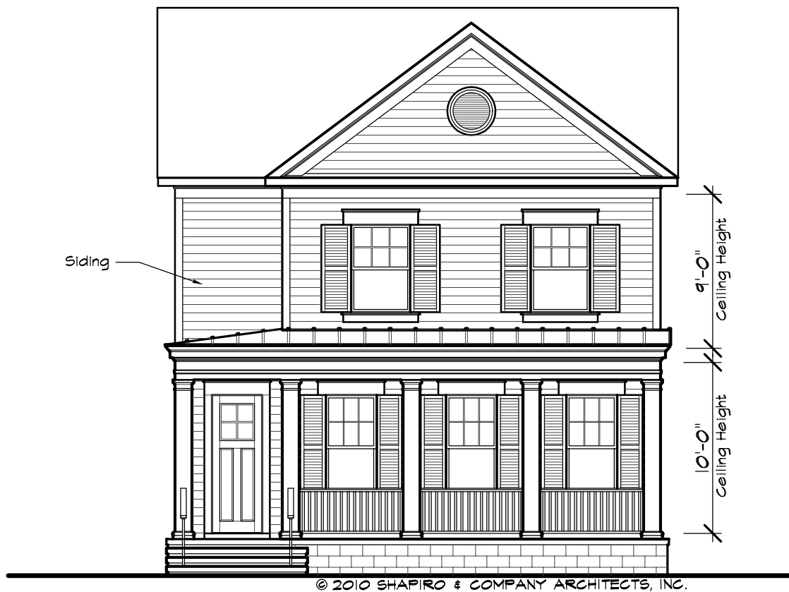
1 Front Elevation "A" Scale: \frac{1}{8} " = 1'-0"