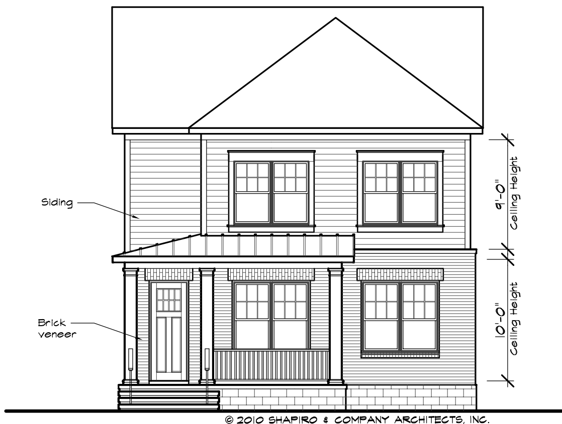
2 Front Elevation "B" Scale: \frac{1}{8} " = 1'-0"